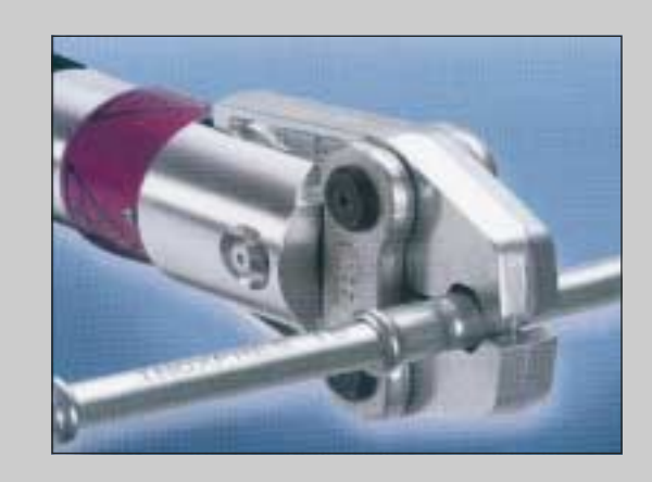
A pressfitting tool clamping an Inoxpres fitting

Where other techniques may be more suitable for a specific