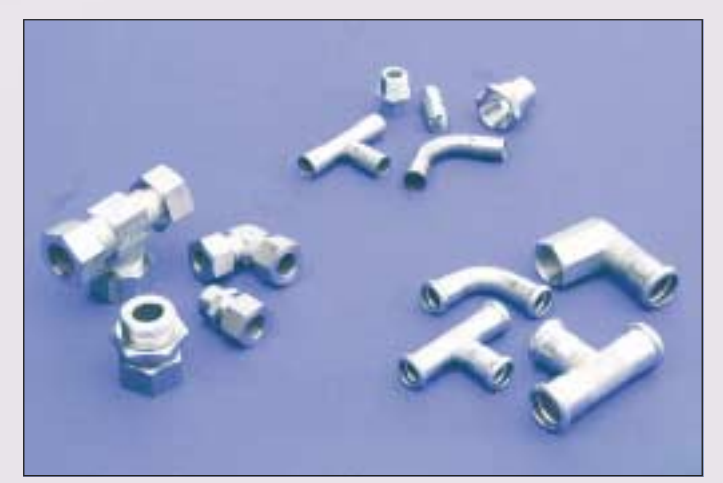
Lancashire Fittings compression, capillary & press fittings