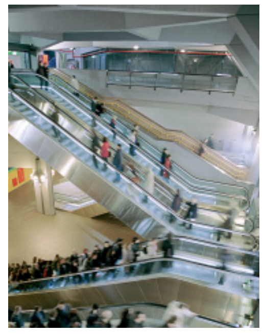
Client: Azienda Trasporti Milanesi S.p.A., Milan, I

The advantages provided by stainless steel are its easy maintenance and cleaning, and its durability. A wide range of surface designs – from matt to mirror-polished, patterned or perforated – gives architects and designers plenty of scope for integrating these important features attractively into the particular situation and meeting all the technical requirements.