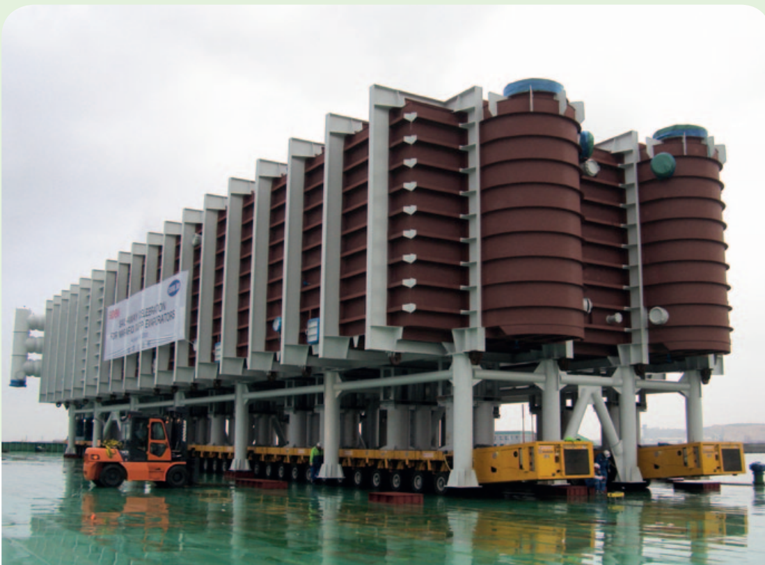
MED type evaporator of Marafiq IWPP in Saudi Arabia

Successful desalination requires a material that can resist the aggressive corrosion caused by seawater and brine. Utilising stainless steel to create fresh water further increases the sustainability profile of the desalination industry. The durability and minimal maintenance requirements of stainless make it a good choice economically. The high-level of recycled content and 100% recyclability at the end of its life are the cornerstones of stainless steel's environmental profile. High performance stainless steels, including duplex grades, are the perfect choice for desalination.