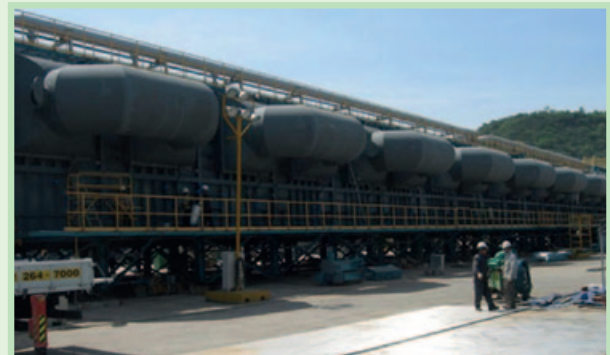
A desalination evaporator

"We use duplex stainless steels for the pipes and fittings of various water systems. Duplex stainless steels account for about 30% of the stainless used in these applications," explains Kyungkoo. "The duplex stainless steel matches the specifications of the plant's owners and is less costly than nickel-based alloys and cladding materials. In addition, duplex stainless steels resist pitting and crevice corrosion and are suited for high-chloride environments. We also use duplex grades for high-pressure piping lines, where the required mechanical strength is higher than austenitic stainless grades can provide. If delivery times for duplex stainless steels compare favourably with those of 300 grade, and maintain their cost-advantage over nickel-based materials, we will be very satisfied and will extend their use." 5