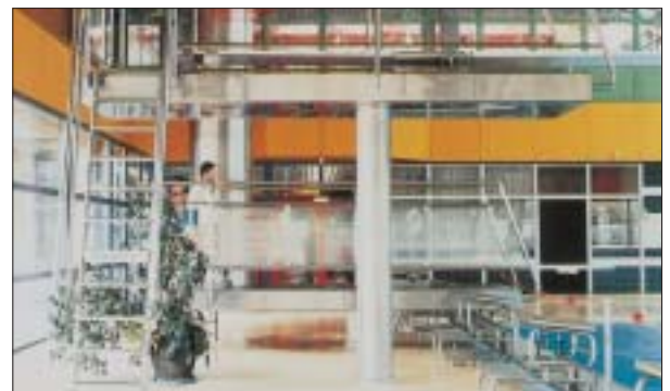
Fig 1. Stainless steel is a popular material in swimming pools