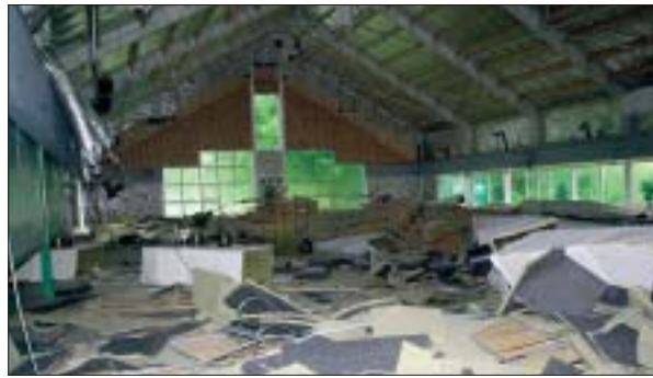
Fig 2. Collapsed swimming pool ceiling in The Netherlands

Corrosion can be effectively controlled by a combination of good design, careful selection of SCC-resistant grades of stainless